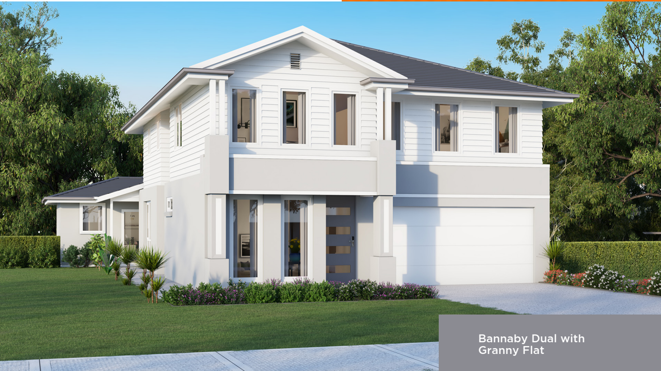
Bannaby Dual with Granny Flat