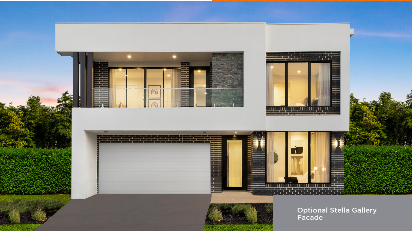
Optional Stella Gallery Facade

10 beds, 6 bathrooms, 6 sofas, 2 cars, 49.2sq / 459.8sqm