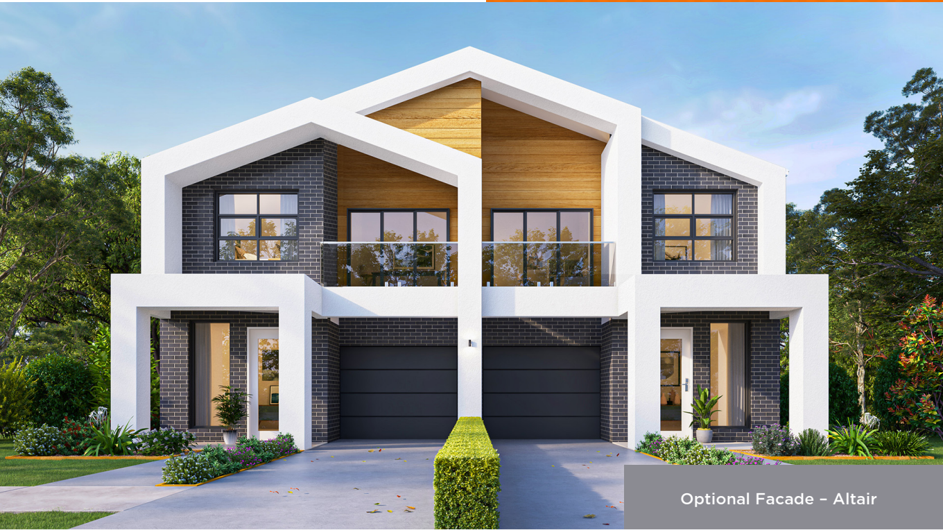
Optional Facade - Altair