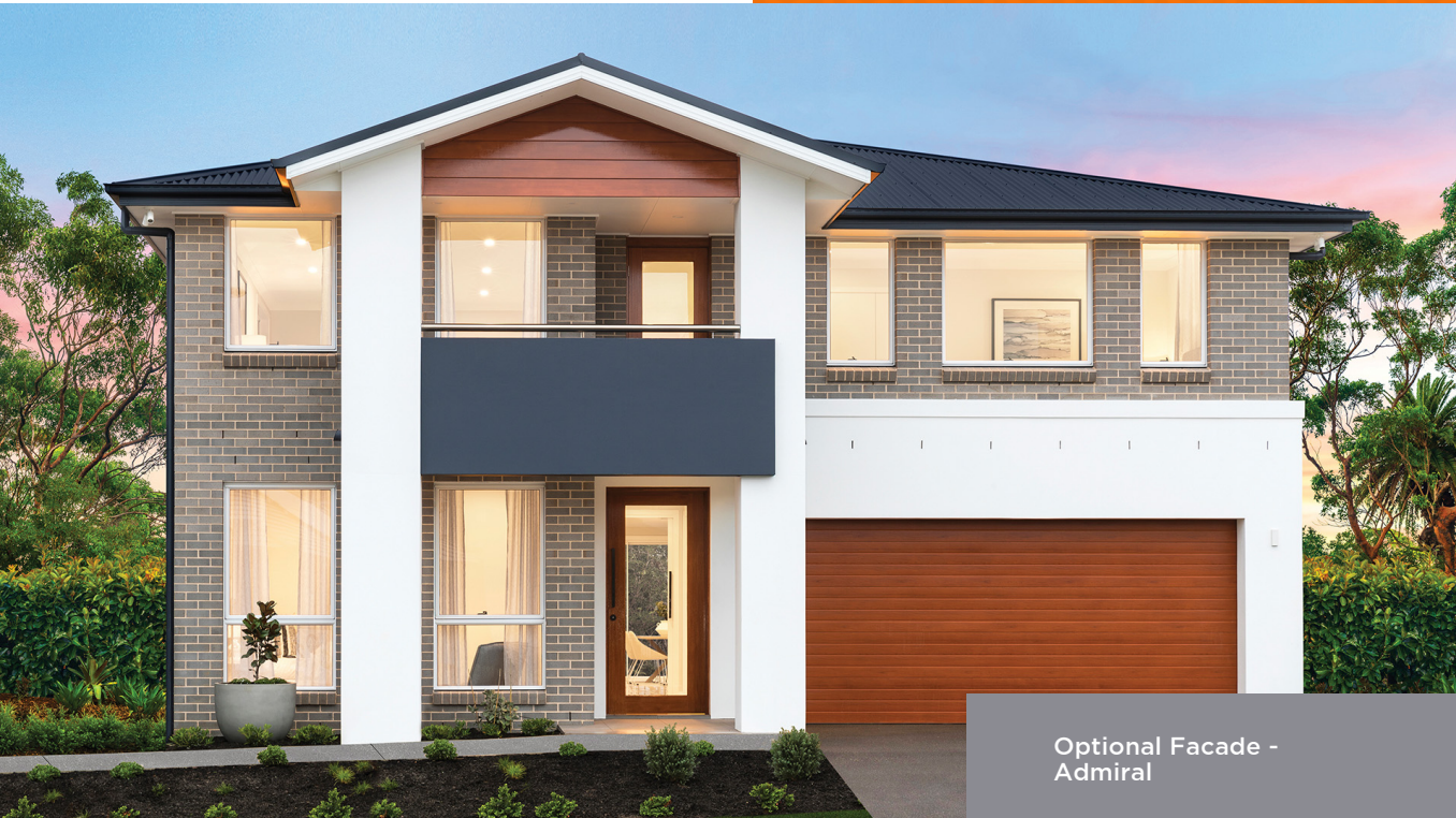
Optional Facade - Admiral