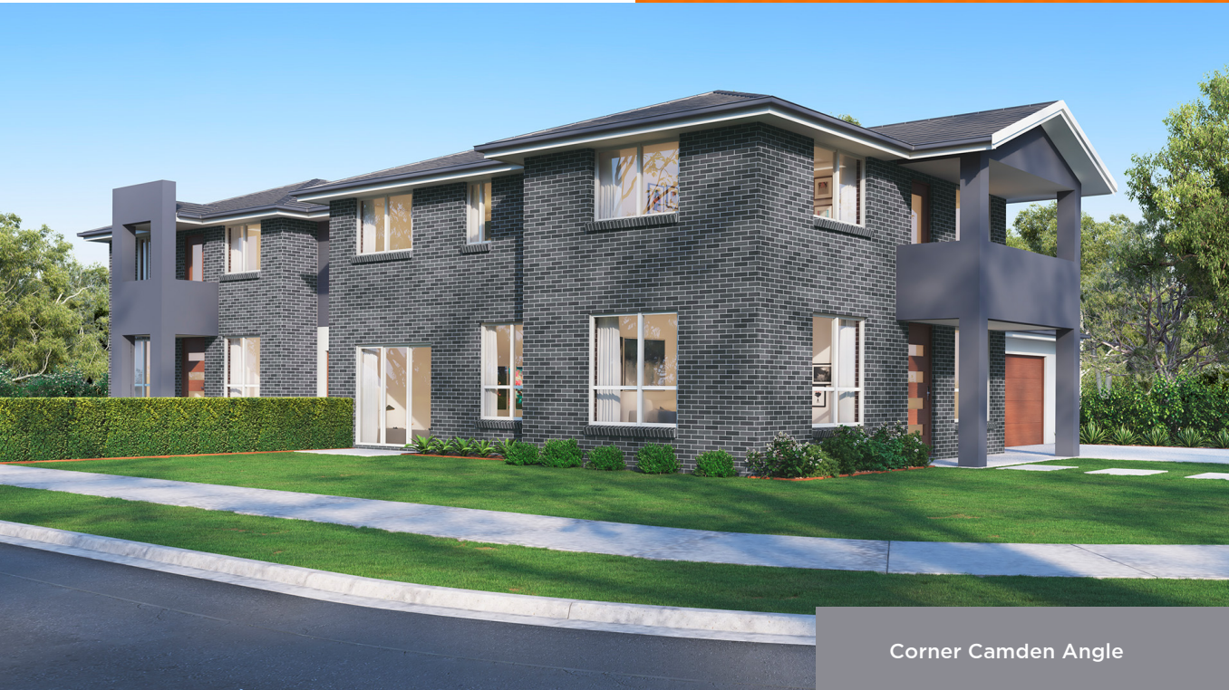
Corner Camden Angle