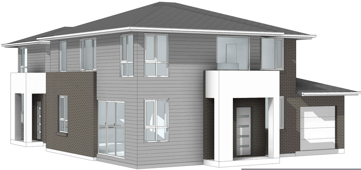
Corner Hillgrove Angle

4 beds, 3 baths, 1 lounge, 2 cars, 19.8sq / 184.56sqm