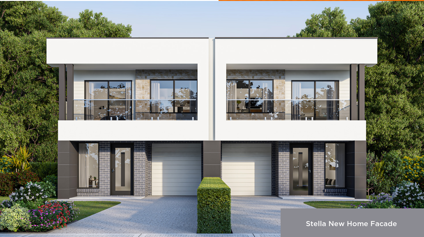
Stella New Home Facade

12 beds, 4 bathrooms, 2 sofas, 2 cars, 50sq / 557sqm