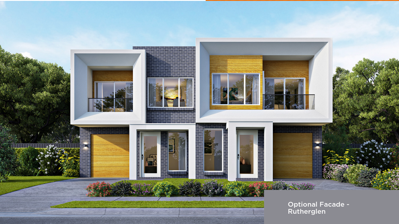
Optional Facade - Rutherglen