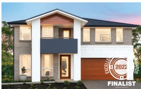
Grandworth Newbury 37, HomeWorld Box Hill