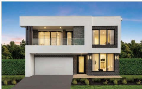
Gallery MKII, HomeWorld Leppington