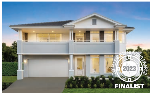
Grandworth Dynasty 40, HomeWorld Leppington