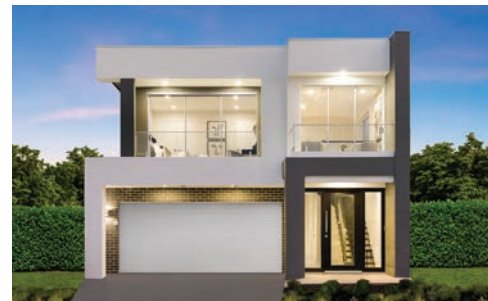
The Prestige, HomeWorld Leppington