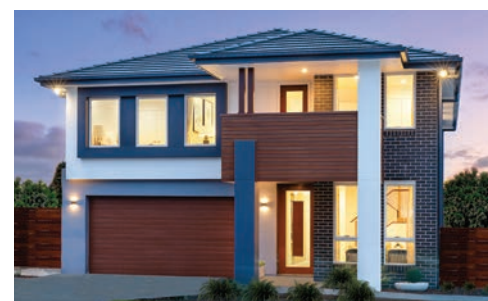
Crest, HomeWorld Marsden Park