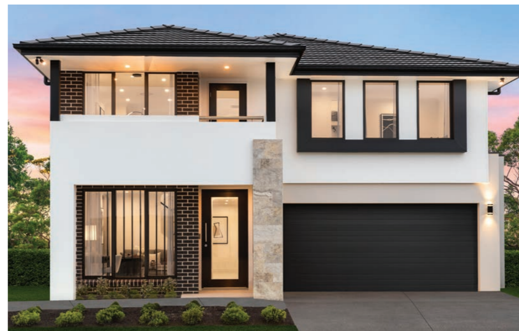
Big Bannaby 36 Ascot, HomeWorld Box Hill