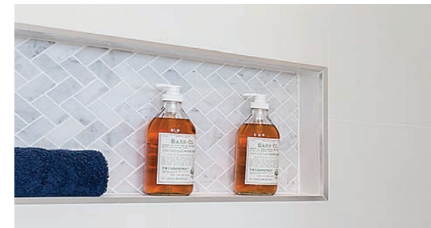
8. Tiled recessed soap niches