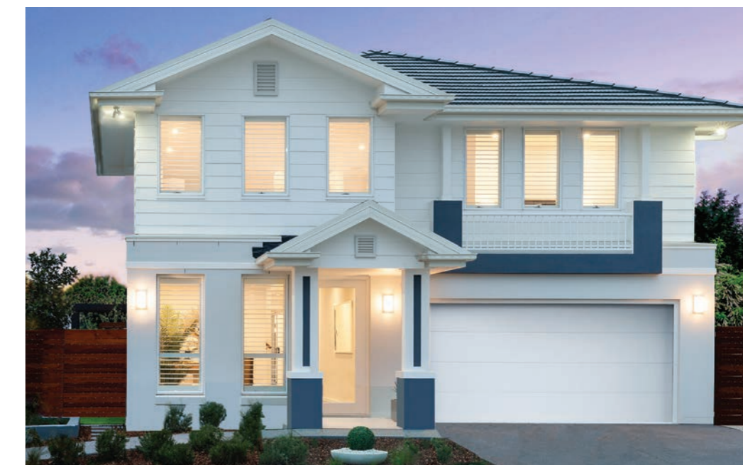
Big Bannaby 33, HomeWorld Marsden Park