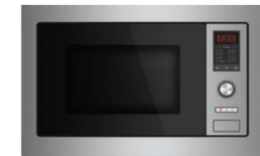
2. Technika 28 litre stainless steel microwave and fitted trim kit