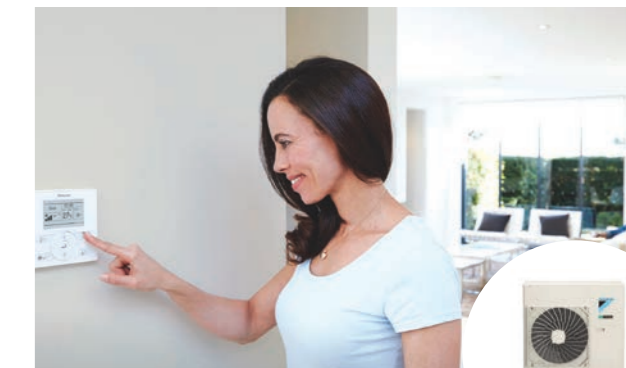
16. Daikin superior inverter fully ducted reverse-cycle air-conditioning system