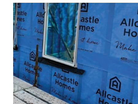
21 & 22: Roof & Wall Sarking