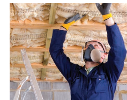
20: R5.0 Top Storey Trussed Roof Ceiling Insulation