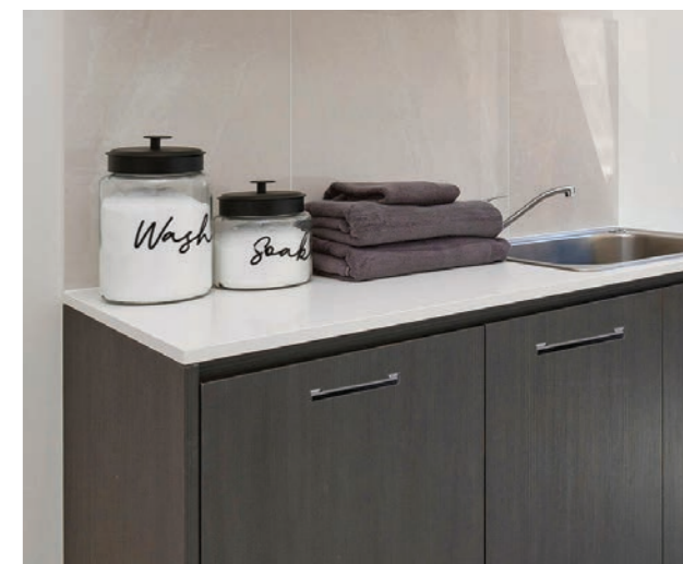
9. Upgrade 1500mm long laundry unit with laminate top and stainless steel drop-in tub