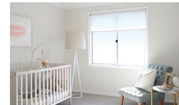
18. 15 X Quality Roller Blinds