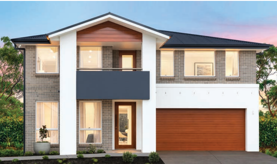
Grandworth Newbury 37, HomeWorld Box Hill