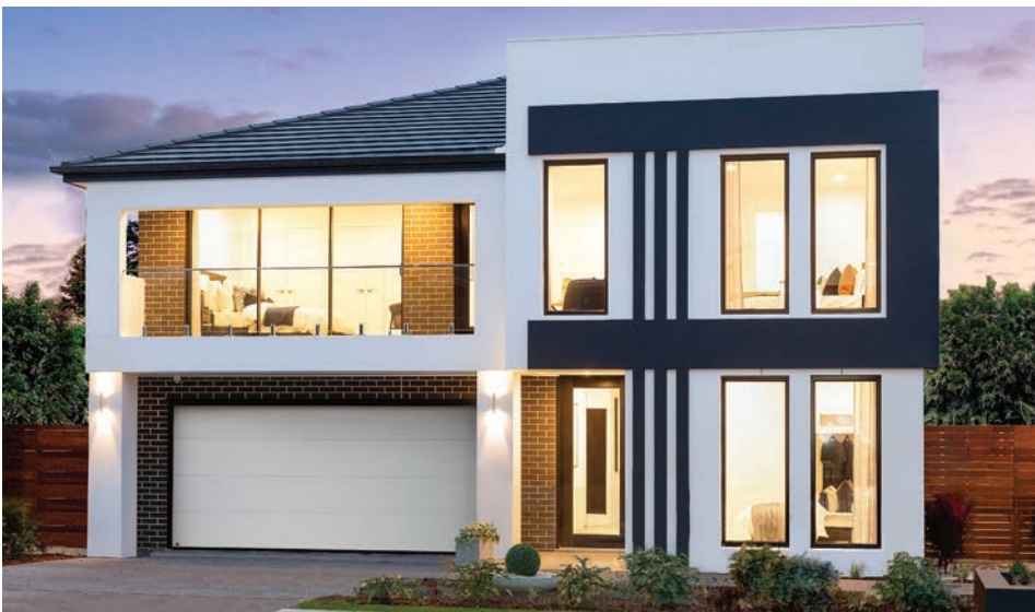
Gallery, HomeWorld Marsden Park