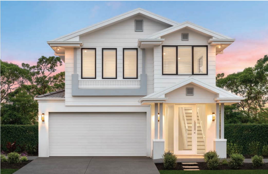
Bannaby Avoca, HomeWorld Box Hill