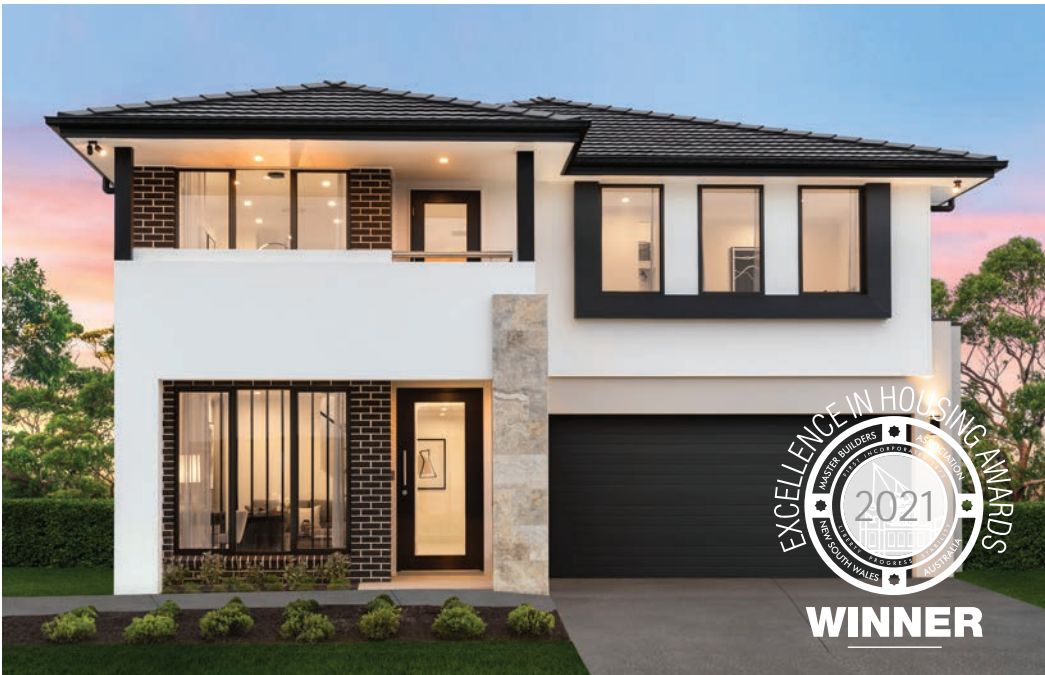
Big Bannaby 36 Ascot, HomeWorld Box Hill