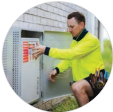
2. BATTERY STORAGE SYSTEM

Fully fitted 7kW single phase charger with 4m type two lead in garage. Supplied & installed.