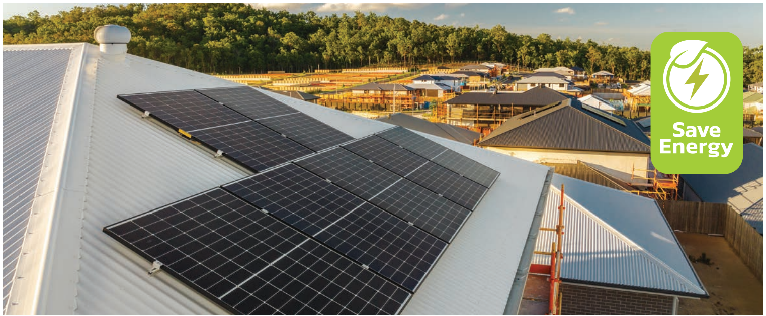
1. SOLAR PANELS 8kW solar roof panels. Supplied and installed.