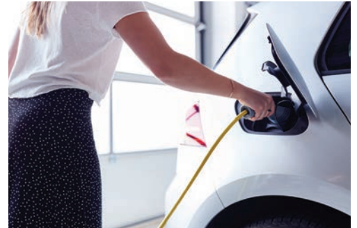
3. EV CHARGER

Fully fitted 7kW single phase charger with 4m type two lead in garage. Supplied & installed.