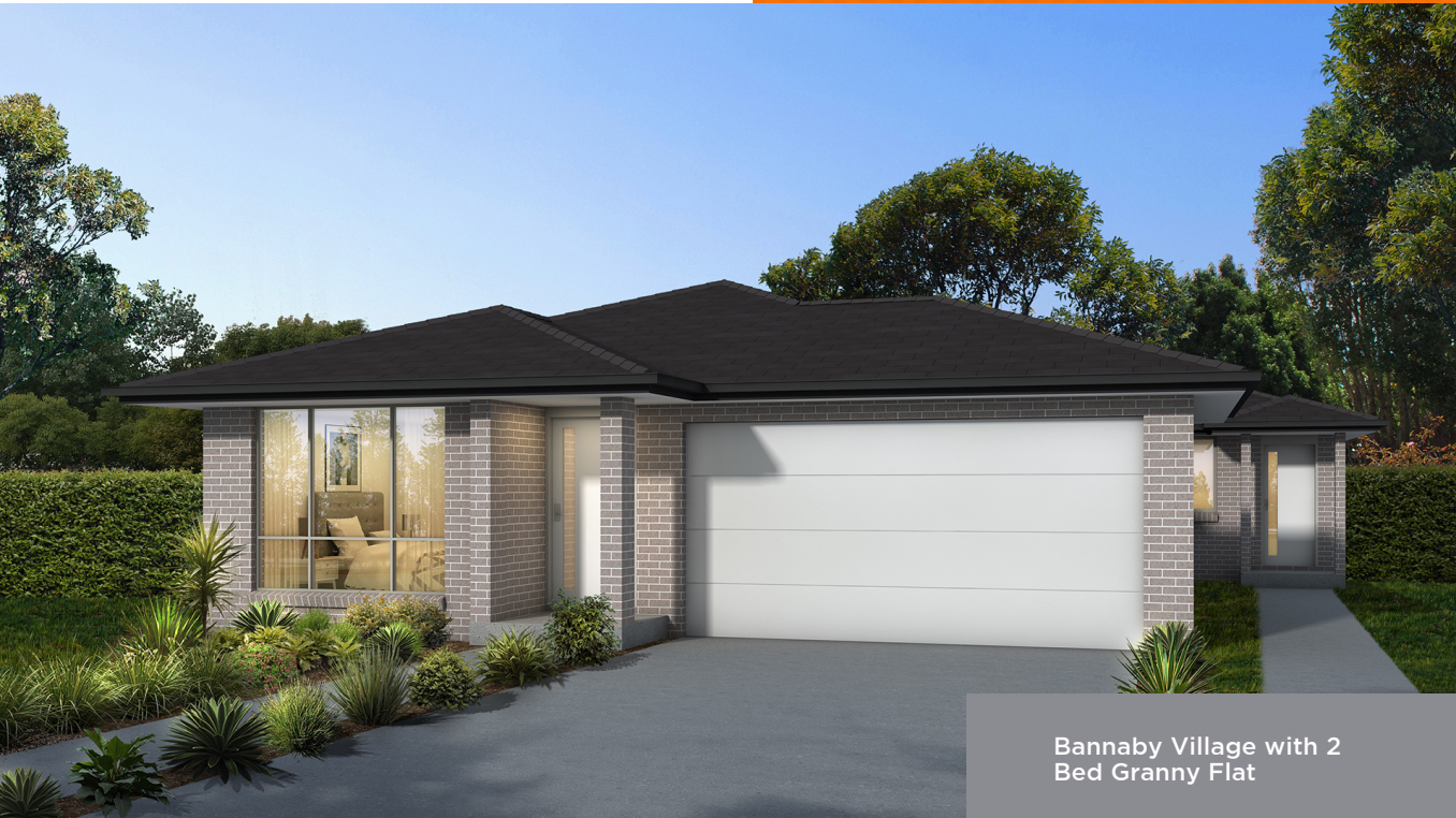
Bannaby Village with 2 Bed Granny Flat