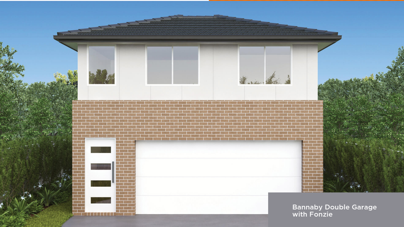
Bannaby Double Garage with Fonzie