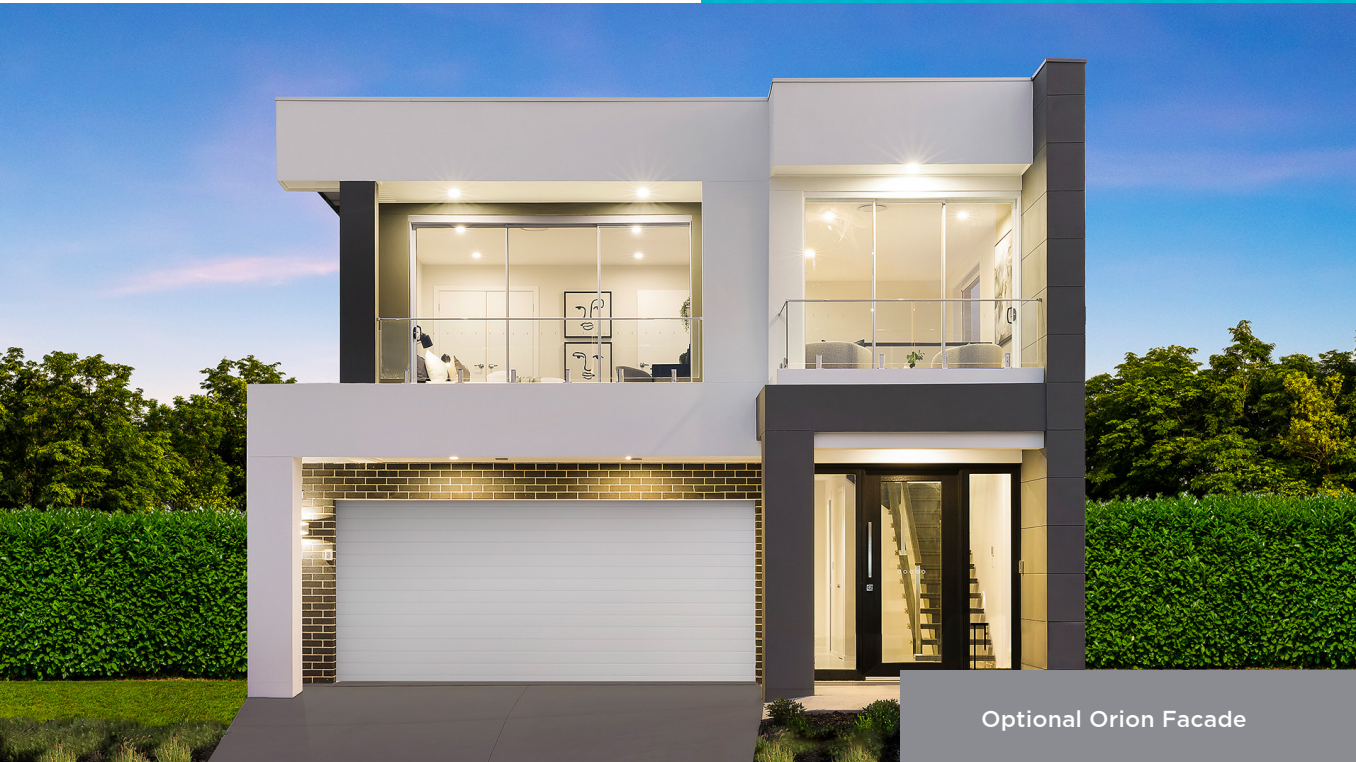
Optional Orion Facade

4 beds, 3 baths, 3 sofas, 2 cars, 32sq / 296.9sqm