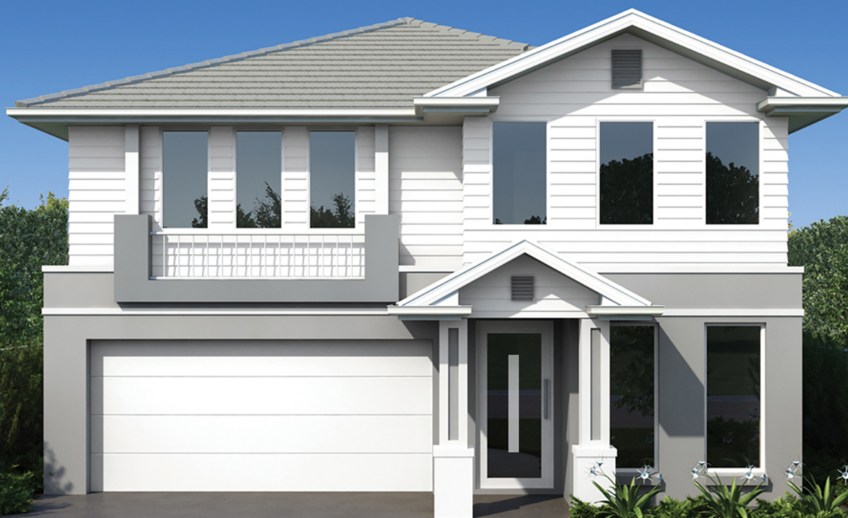
Artist impression for illustrative purposes only