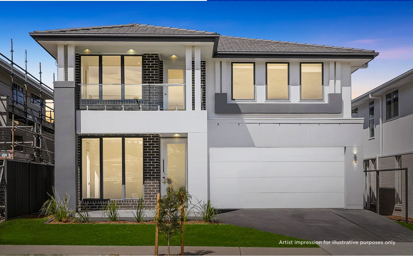
Artist impression for illustrative purposes only