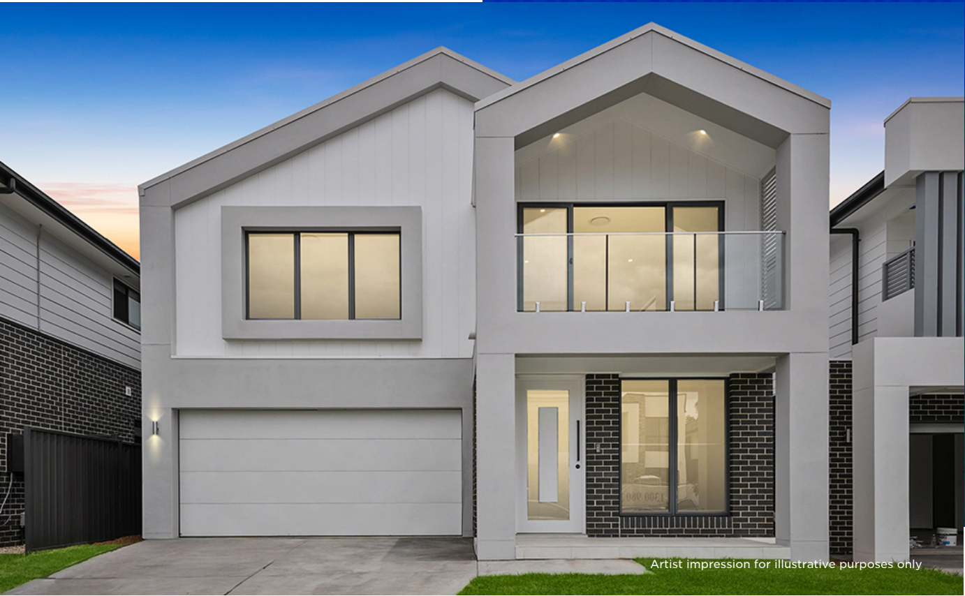
Artist impression for illustrative purposes only