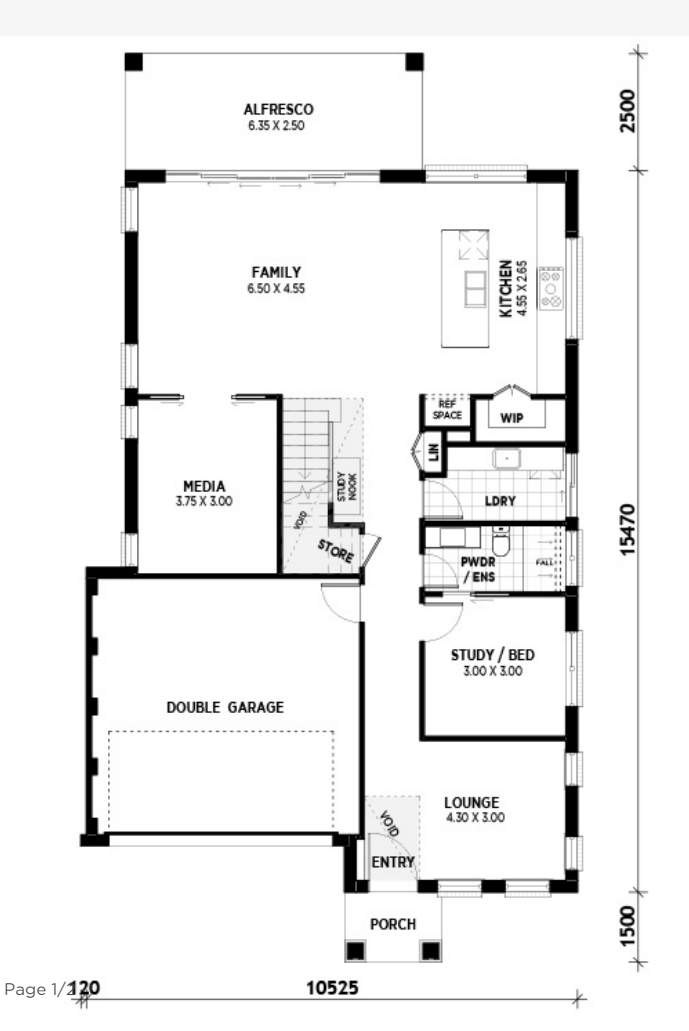
Land Details 350.1m<sup>2</sup>