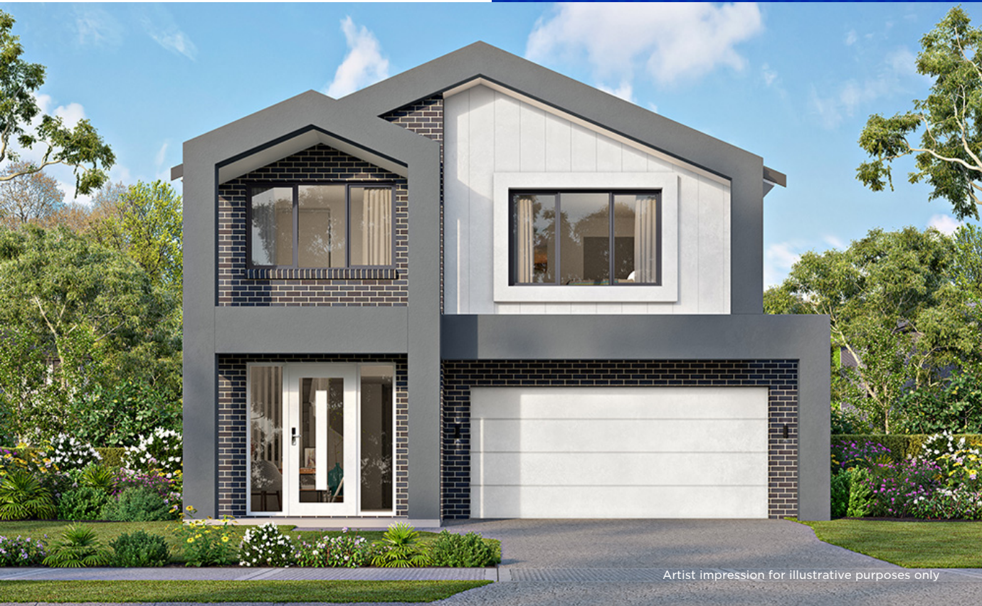
Artist impression for illustrative purposes only