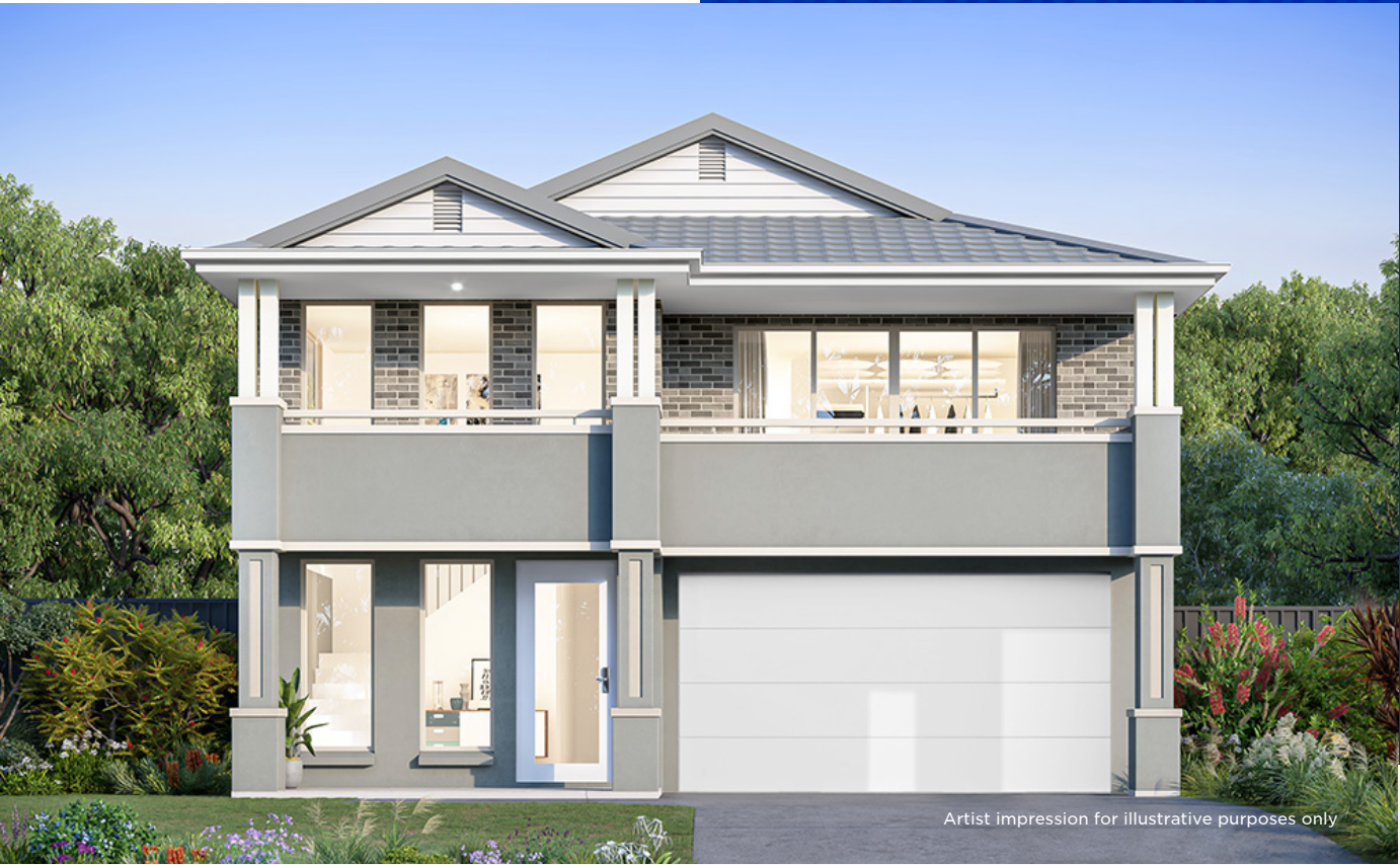
Artist impression for illustrative purposes only